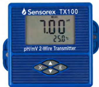
pH/ORP TRANSMITTERS AND CONTROLLERS

Use data from any of our sensors to program process control. Our complete line of 4-20mA pH, ORP, and conductivity transmitters and controllers can be integrated into a variety of systems.