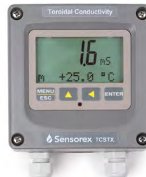
TOROIDAL CONDUCTIVITY TRANSMITTERS