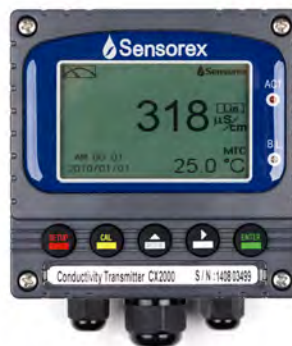
CONDUCTIVITY TRANSMITTERS AND CONTROLLERS